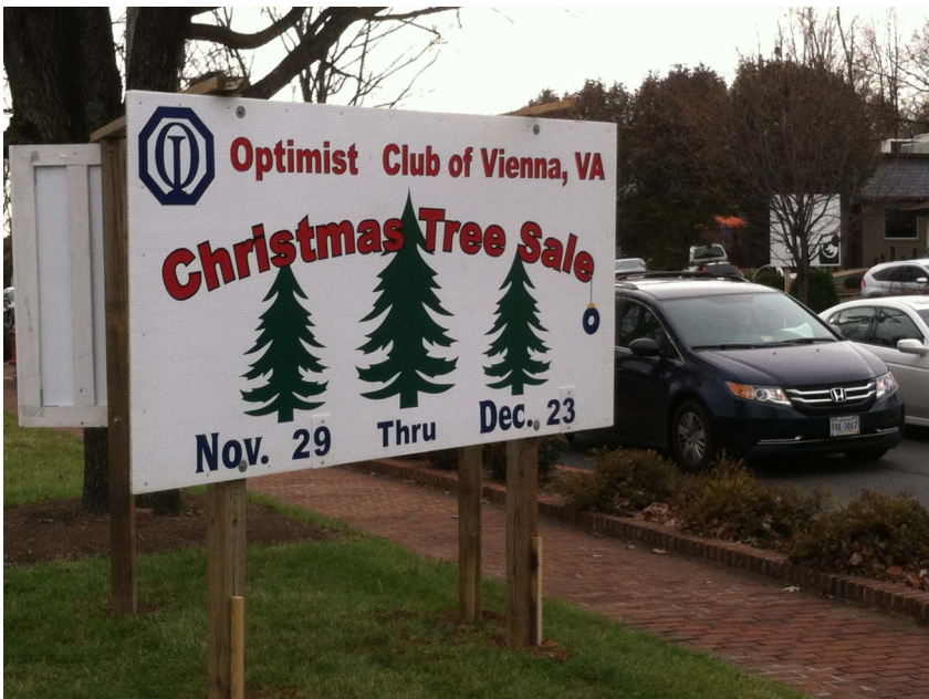
Editor's Note: File photo has been blatantly altered to avoid emails saying the dates are wrong.